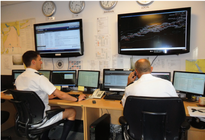
Operations room UKMTO

It is important that vessels and their operators complete both the UKMTO Vessel Position Reporting Forms and register with MSCHOA