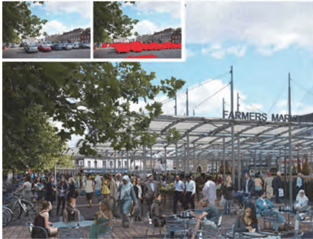
Figure 2 Image of use of parking lot 9)

As the significance of automated driving, the ability to do other work while traveling, rather than simply driving the automobile, is considered important in other countries. Naturally, the ability to do other work while traveling increases work productivity. Moreover, if a long-distance driver can rest during traveling time while not actually driving the vehicle, this will also lead to improvement of work conditions. Effectiveness can be increased further if it is possible to enhance the added value of connected cars by installing automated driving systems to other vehicles. Automated driving is also expected to contribute to urban development. If all automobiles are automated, it is thought that the existing road space can be redistributed based on a review of the relationship between traffic volume and road capacity, thereby contributing to effective use of surplus land. For example, if the concept of private ownership of automobiles is eliminated, parking lots will no longer be necessary, and that space can be utilized effectively. It will also become possible to manage expressways with fewer lanes, and that space can be used for solar panels or bicycle roads. (See Figs. 2 and 3; driving automation eliminated the need for the roadway areas shown in red.)