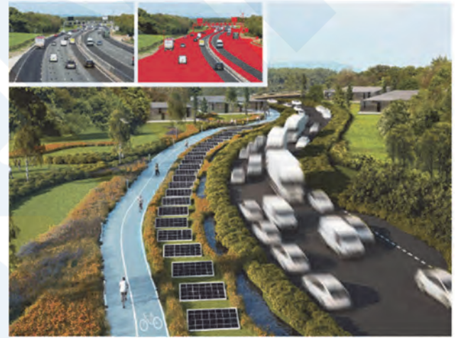
Figure 3 Image of use of surplus lanes of expressway 9)