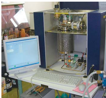
Combustion test using FIA-100FCA (Standard: IP541/06)