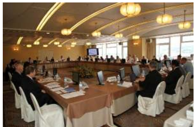
Photo 2 The 63rd Council Meeting