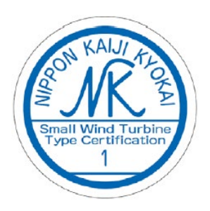
Figure 1 Certification Seal