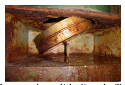
Post too short, disk slipped off