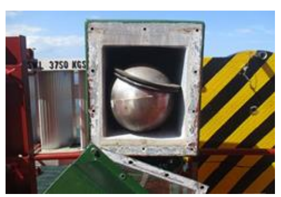
Gasket slipped off