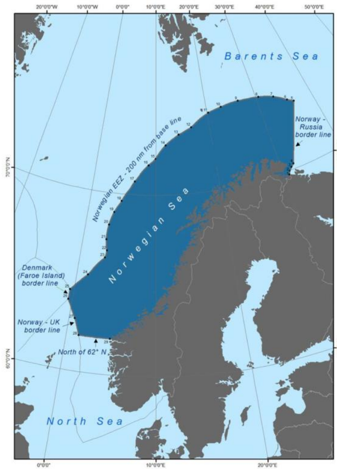
Fig. 2: Illustration of Norwegian Sea ECA