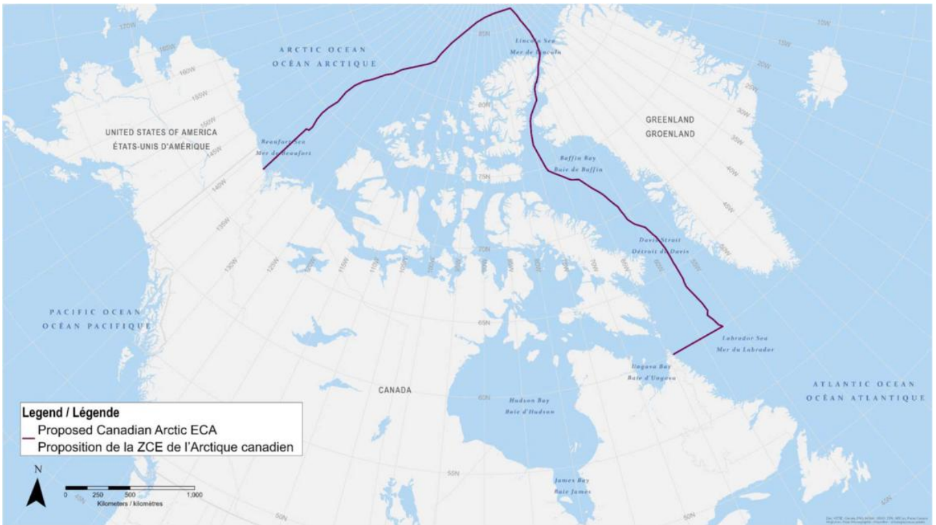
Fig. 1: Illustration of Canadian Arctic ECA