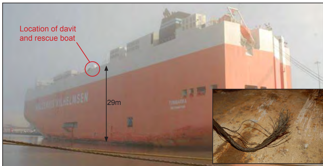
Vessel and parted fall wire

The 12mm diameter fall wire had a certified minimum breaking load of 141kN. Its safe working load (SWL) was 23.5kN based on a factor of safety of six. The wire was fitted to a single-arm davit (SA 1.5) ( Figure 2 ), manufactured by Umoe Schat-Harding Equipment AS (Schat-Harding). The davit system was powered by a Schat-Harding W50 two-speed electric winch with a nominal pull of 50kN.