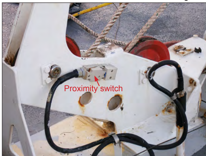
Proximity switch on davit

The winch was operated by a control panel sited forward of the davit. The boat was hoisted using the buttons on the control panel until the davit was near the stowed position. It was then intended that hoisting be completed manually by the use of a winch handle adjacent to the winch motor. To prevent the inadvertent operation of the winch when the rescue boat was in its stowed position, an inductive proximity sensor/switch (Telemechanique XS7-C40FP260) was fitted on the davit ( Figure 3 ). The switch was intended to cut off power to the winch when the davit closed to within approximately 12mm of the sensor.